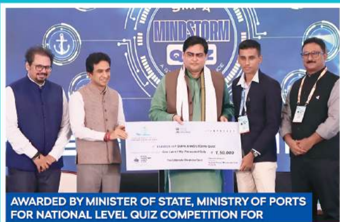
AWARDED BY MINISTER OF STATE, MINISTRY OF PORTS FOR NATIONAL LEVEL QUIZ COMPETITION FOR