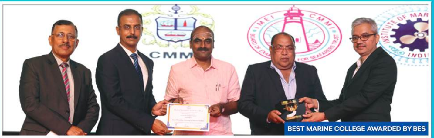
BEST MARINE COLLEGE AWARDED BY BES