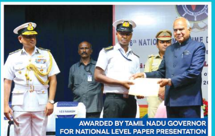
AWARDED BY TAMIL NADU GOVERNOR FOR NATIONAL LEVEL PAPER PRESENTATION